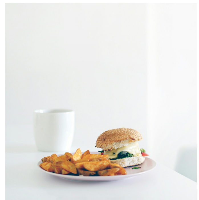
FREEZE DRIED FOOD: Now as fresh as real food.

You can find this machine on Amazon, eBay and in Argos. It costs £100,000 pounds.