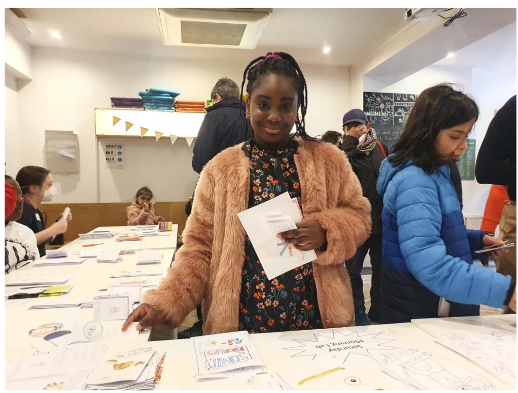
Zine Fair, open to the public, Spring 2022