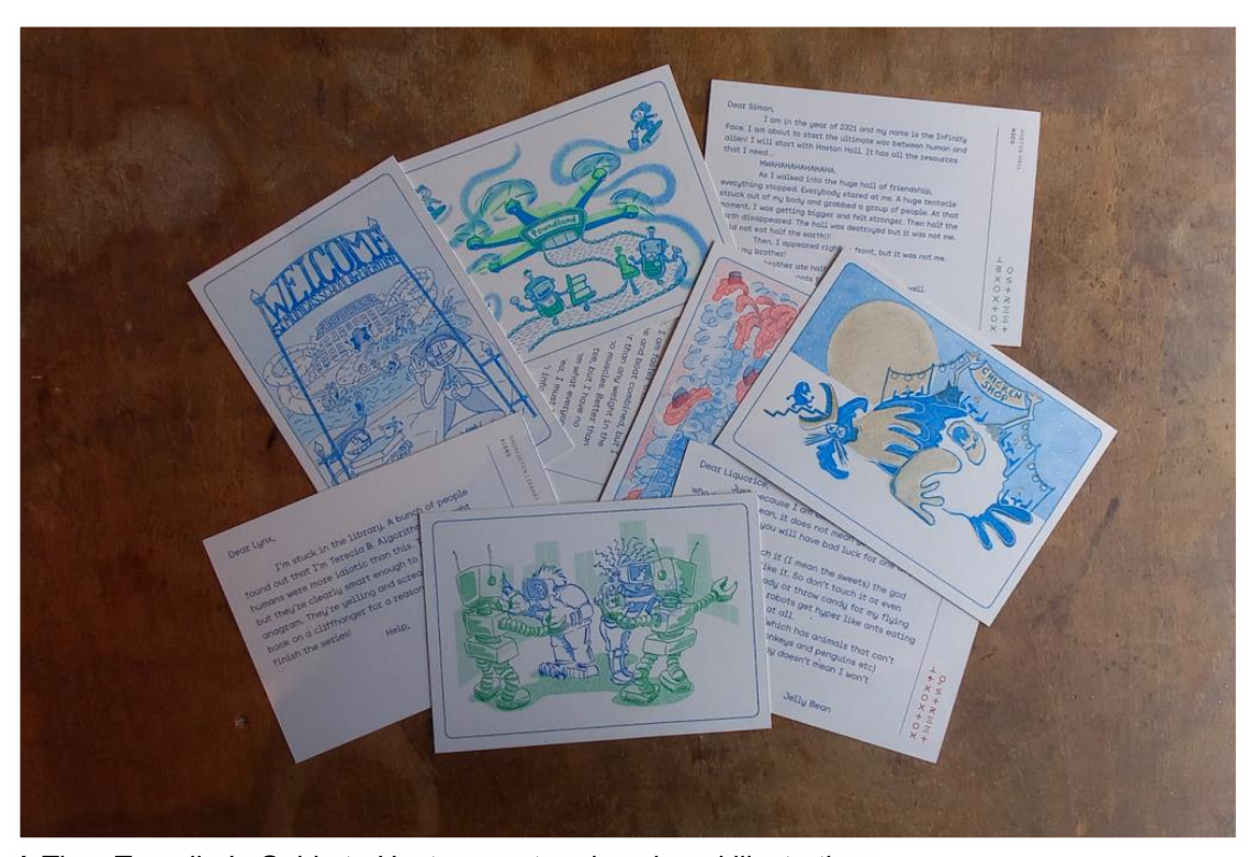
A Time Traveller's Guide to Hoxton, postcard pack and illustrations