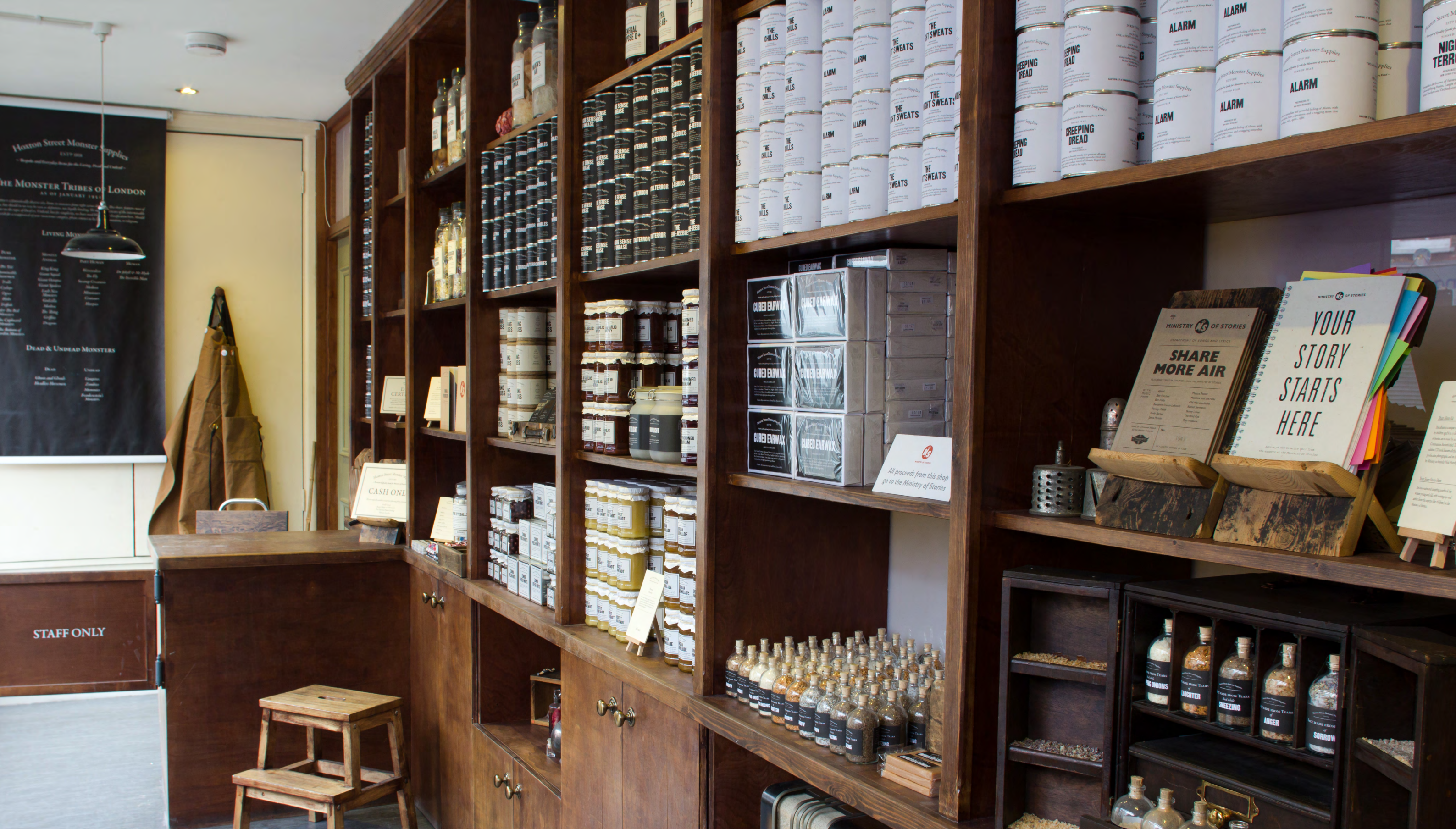
Hoxton Street Monster Supplies – interior